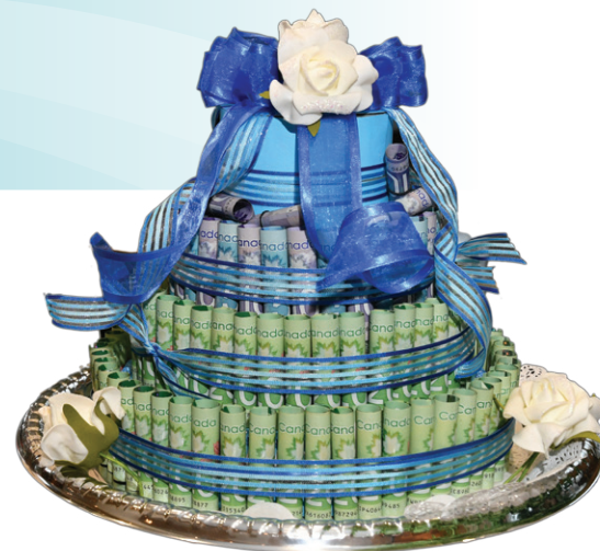
Donation from Le Savignon craft group in the form of a beautiful cake

After much discussion they decided to make wooden bookmarks. "Our goal was to raise $2,000 for the hospital. We started in September and within a mere two months our objective was met," explains Mrs. Dagenais. "We didn't think we'd reach our goal," she admits. "At $3 apiece, you have to sell a