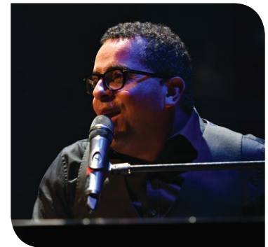
Gregory Charles in concert

and went on to sing top hits from every year that was suggested between 1938 and 2017. On several occasions throughout the show, the audience sang along with him. From beginning to end, he had the crowd in the palm of his hand.