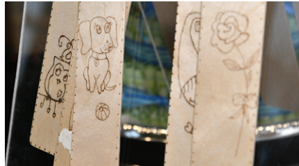
Bookmarks made by Le Savignon craft group